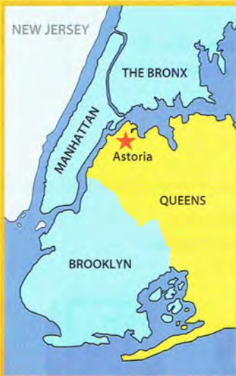
Astoria is a neighborhood in Queens in New York City.

1 The sidewalks are crowded with Indian women in colorful traditional dress. A woman on the corner is selling Chinese cakes. A new song from a Romanian band is playing in a restaurant. Is it