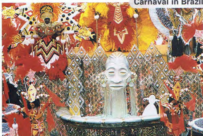
Carnaval in Brazil

A ▶ Mike has just returned from Brazil. Listen to him talk about Carnaval. What did he enjoy most about it?