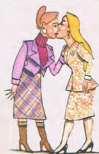
a kiss on the cheek