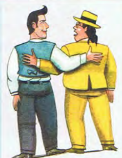
a pat on the back

Sources: A World of Difference Institute; www.brazilbrazil.com