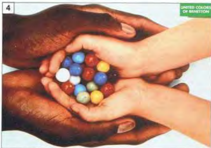
a clothing company