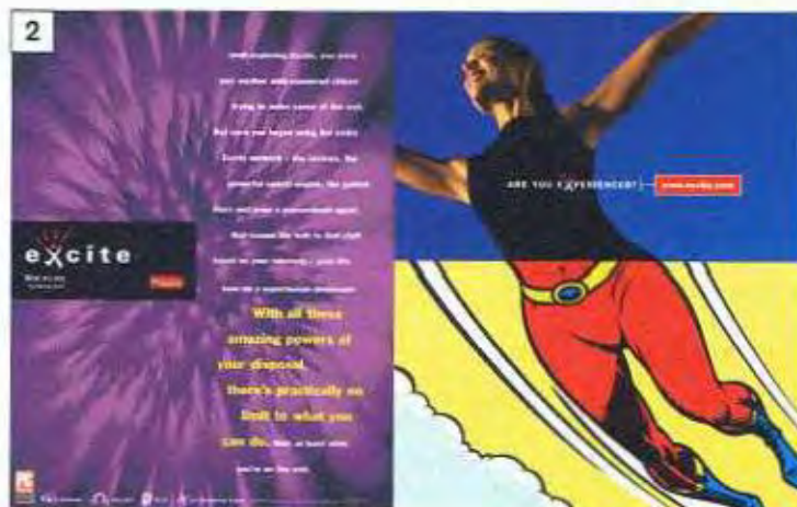
an Internet service