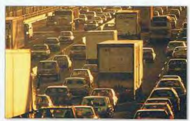
Buses, trucks, and other large vehicles are causing horrible traffic problems on the highways during commuting hours.

B Class activity Share your group's solutions for each problem