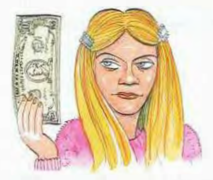
make your allowance go further