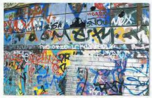
Many buildings downtown are being ruined by graffiti.