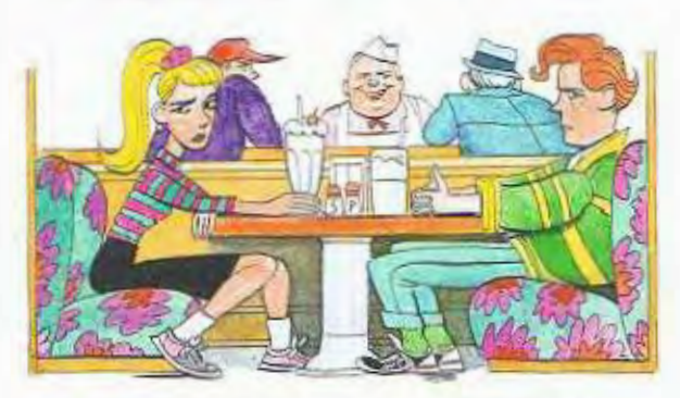
make a good impression on a first date