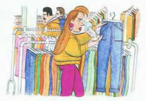
save money on clothes