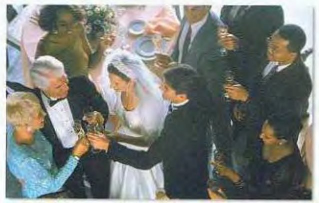
When a couple gets married, the bride's family usually pays for the reception.