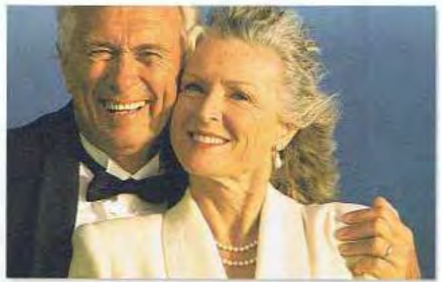
When a couple has an important anniversary (like the 50th), they sometimes renew their wedding vows.