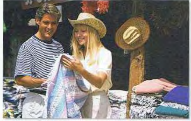
When you come back from a vacation, you're expected to bring small gifts for your friends.