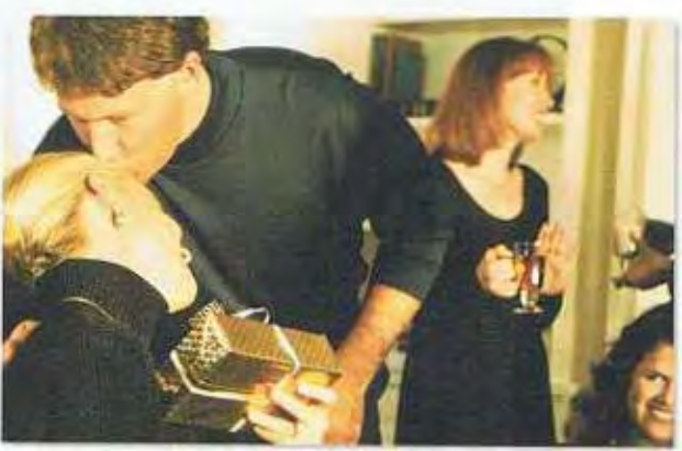
When someone moves into a new home, it's the custom to give a "housewarming" gift.

B Group work Compare your information Are your group's customs the same or different?