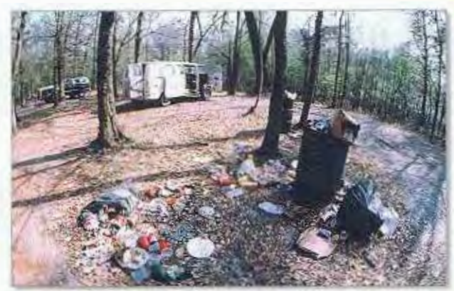
Many parks and sidewalks are littered with empty soda cans and bottles, especially after the weekend.

A Group work Imagine you are a member of an environmental protection committee in your local town. You have to decide what to do about the following problems. Talk about each problem and think of solutions for each one