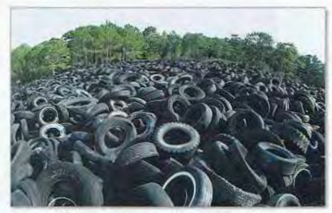
Car-repair shops have a lot of old car tires that need to be gotten rid of.

One thing to do about it is . . . . Another way to help is .... The best thing to do is ..... Why don't we ...?