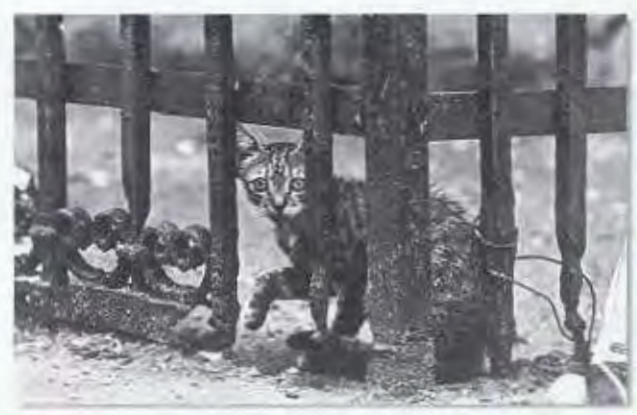
Often, cats that end up in shelters have been abused or abandoned.