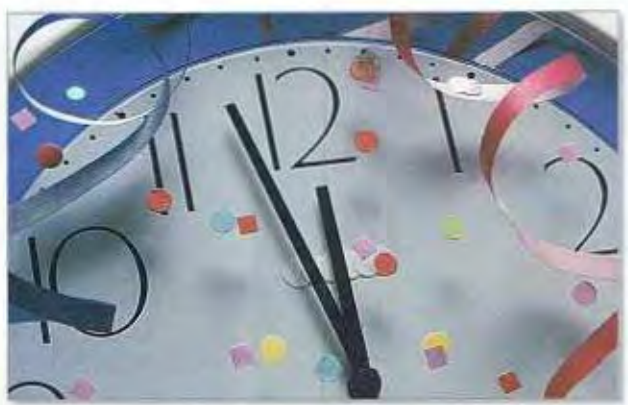
You're supposed to kiss a friend at midnight on New Year's Eve.

A Pair work Look at these photos and the information about the United States and Canada. Are the customs the same or different in your country? Give one or two pieces of information about each event in your country.