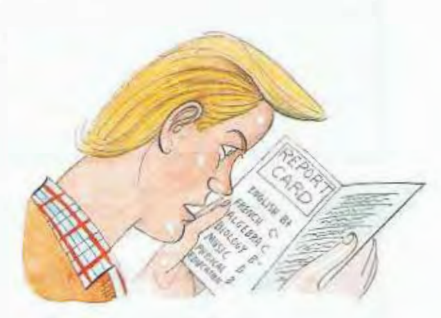
get better grades in school