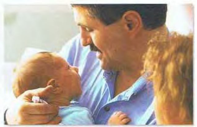
When a child is born, the parents often give cigars to friends.