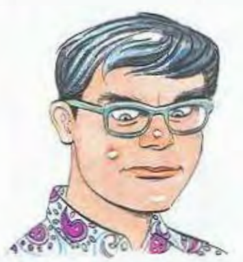
get rid of pimples