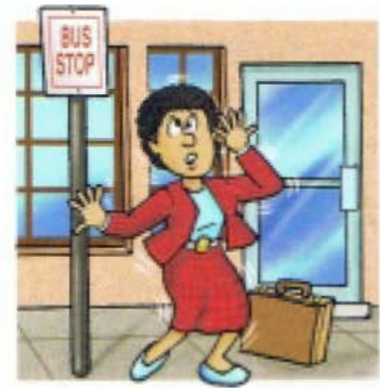
6. Wilma fainted waiting for the bus