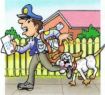
9. the mail carrier a dog bit* him delivering the mail