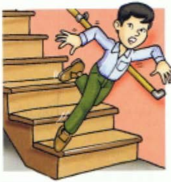
4. Henry tripped and fell* walking down the stairs