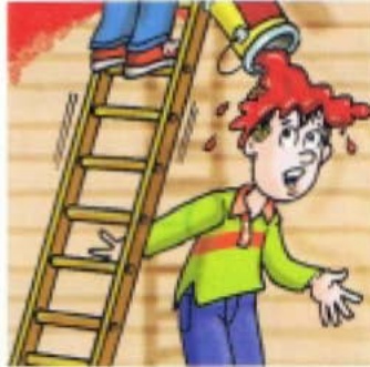
8. you a can of paint fell on me walking under a ladder