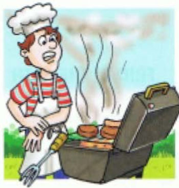
5. you burned myself cooking on the barbecue