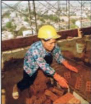
a construction worker in Vietnam

The jobs that men and women have are changing in many countries around the world.