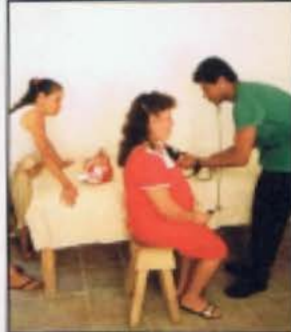
a nurse in Costa Rica