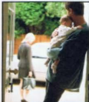
a homemaker in the United States

What jobs do men and women usually have in different countries you know? Is this changing?