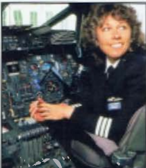
an airline pilot in England