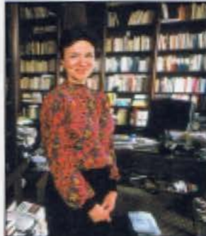
a company president in France