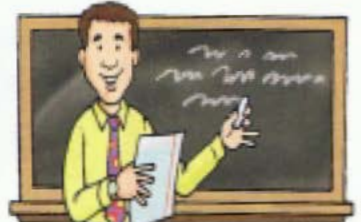
9. a good teacher