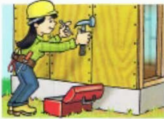
10. a hard worker