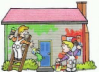
8. bad painters