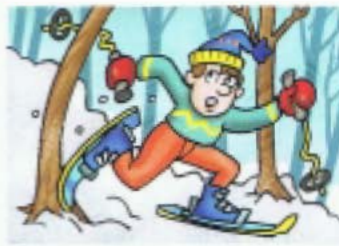
5. a careless skier