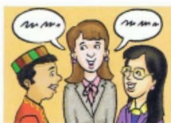
11. an accurate translator