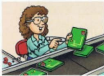
1. a careful worker