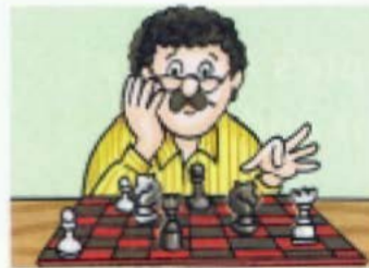
2. a slow chess player