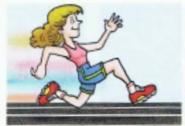
6. a fast runner