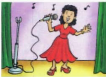
7. a beautiful singer