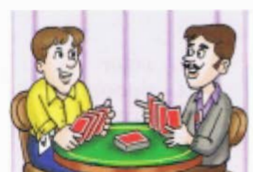
12. dishonest card players