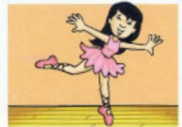
3. a graceful dancer