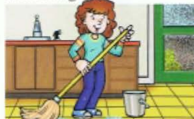
6. Harriet mopping the floor