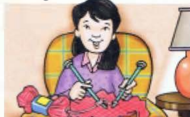
5. you knitting