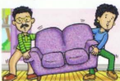
8. your parents rearranging furniture