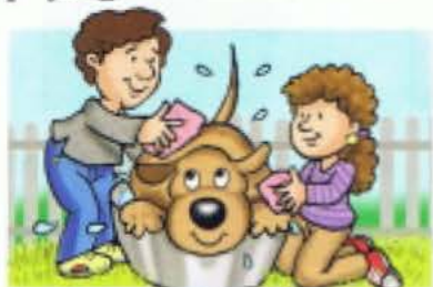
7. you and your wife bathing the dog