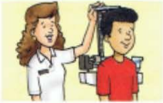
1. I stood on a scale _____