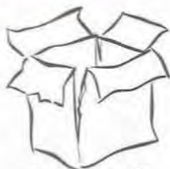
a cardboard box