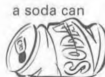
a soda can