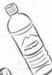
a plastic bottle