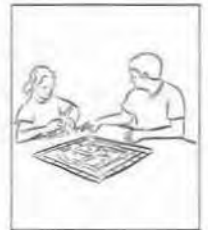
play a game