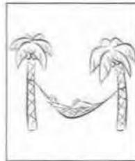
take a nap