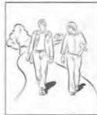
take a walk