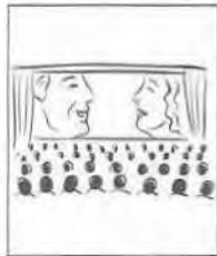
see a movie