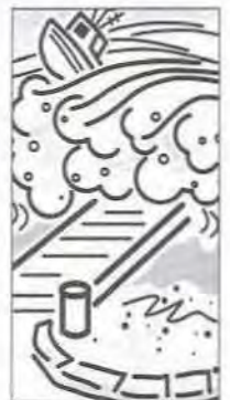
a tidal wave