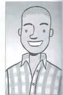
a buzz cut