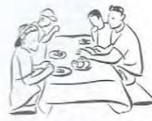
have a picnic