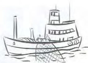
a fishing boat