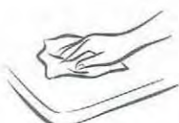
clean the counter