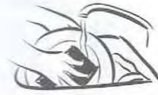
do the dishes