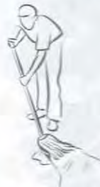
mop the floor