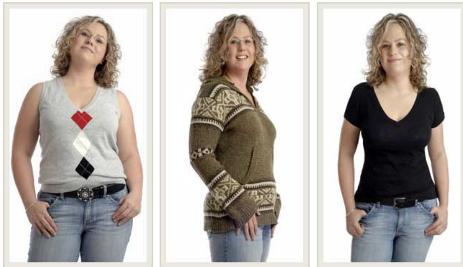
Before trying the two step process, about three weeks later, and today! 29 lbs lighter :)