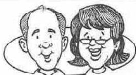
my grandparents (have)