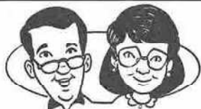
my parents (live)