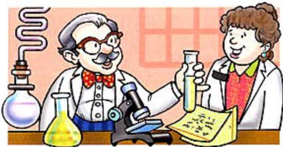
11. I've discovered a cure for the common cold!