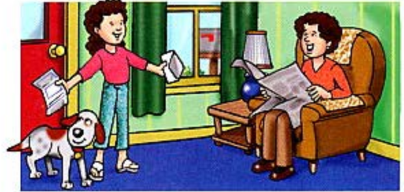
6. I got a perfect score on the SAT test!