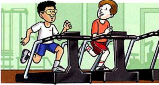
5. My son is going to be in the Olympics!