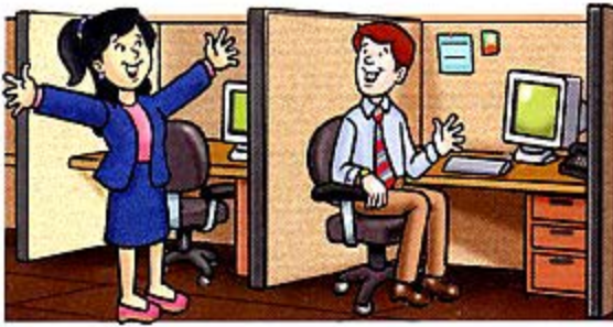
3. I've been promoted!