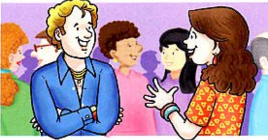
7. Steven Spielberg wants me to star in his new movie!