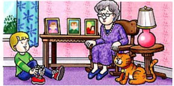
4. I can tie my shoes by myself!