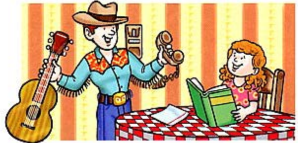
8. I've been invited to perform at the White House!