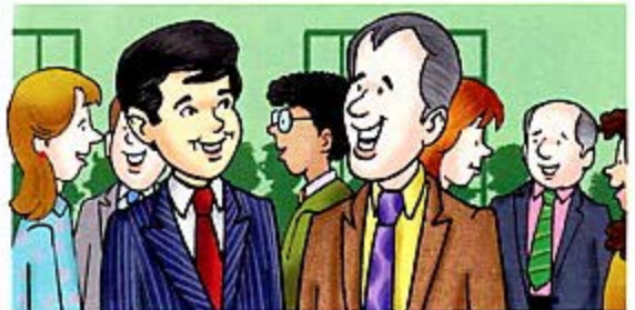
10. My daughter has been accepted at Harvard University!