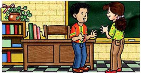
8. hide the teacher's birthday present