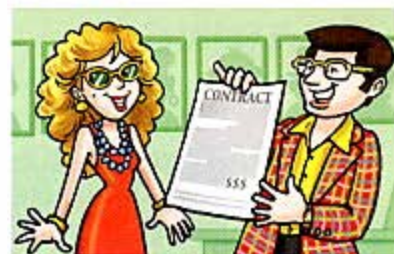
6. Jennifer offered a movie contract