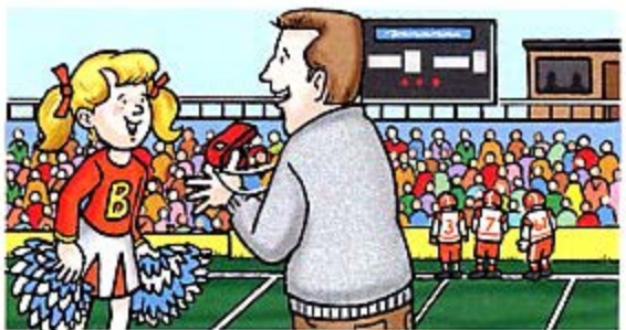
12. sing the National Anthem