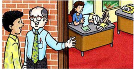
6. distribute the mail