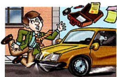
4. Stuart hit by a car