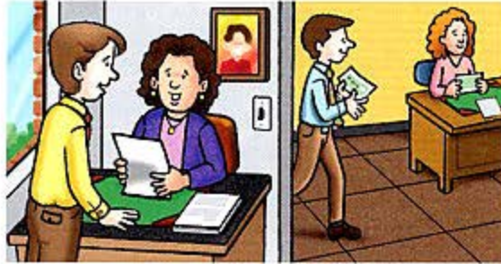
5. give out the paychecks