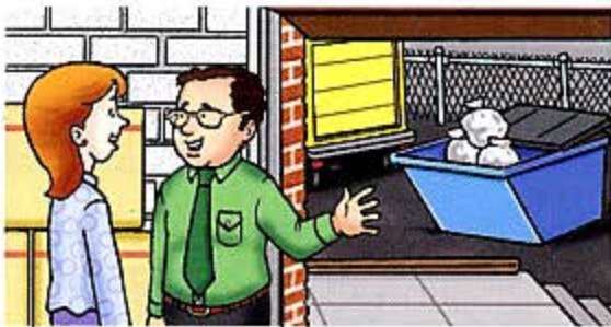
9. take out the trash