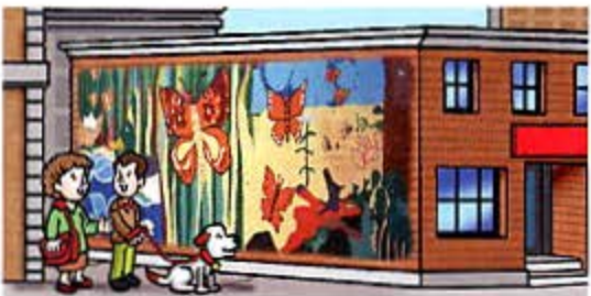
11. This is an extremely colorful mural! do • the students at Central High School