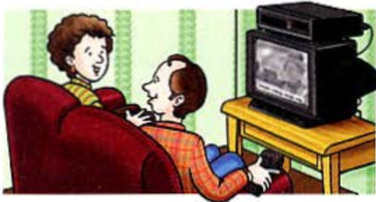
3. This is really a fascinating movie! direct • Fellini