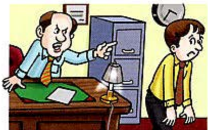
7. Frank fired