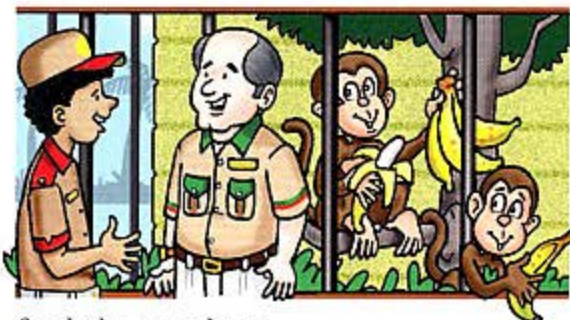
11. feed the monkeys