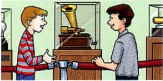
5. This is a very interesting invention! invent • Thomas Edison