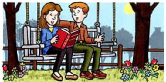
10. This is a very sad poem! write • Shakespeare