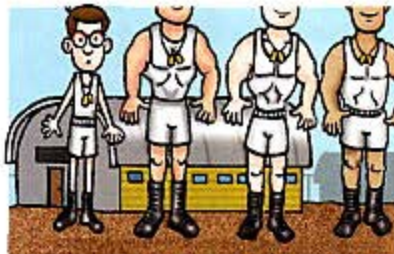
9. Arthur rejected by the army