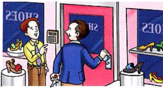
3. set the alarm