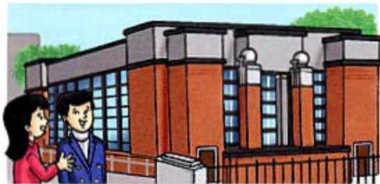
8. This is an impressive building! design • Frank Lloyd Wright