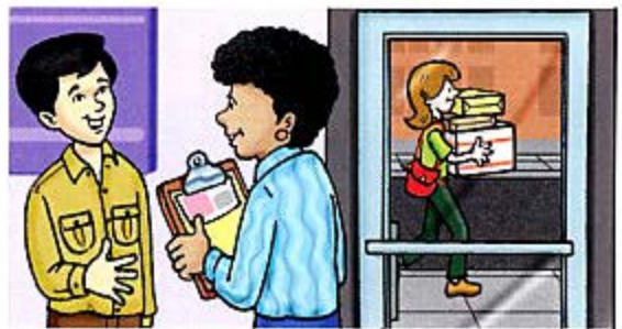
10. send the packages