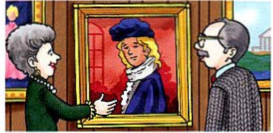
6. This is a magnificent portrait! paint • Rembrandt