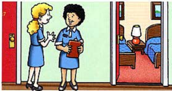
7. make the beds in Room 219