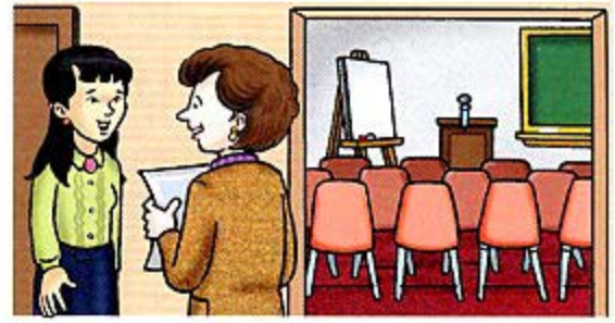
4. set up the meeting room