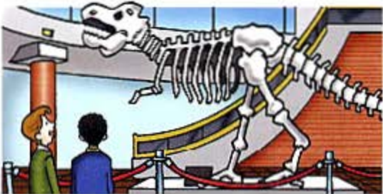
7. This is an amazing dinosaur skeleton! find • archeologists in Asia