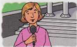
4. a news reporter