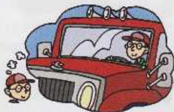
3. a truck driver