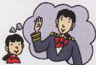
1. a flight attendant