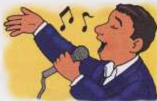
2. a singer