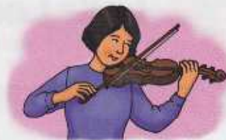
3. a musician