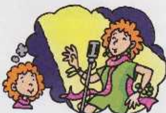
2. a pop idol