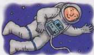
1. an astronaut