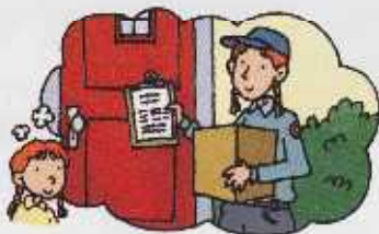
6. a delivery person