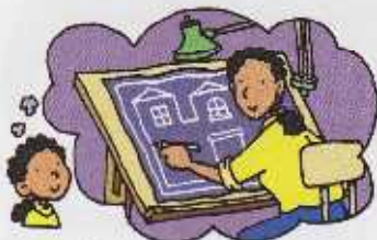
4. an architect