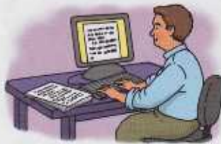
5. a writer