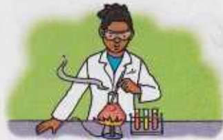
6. a scientist