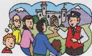
5. a tour guide