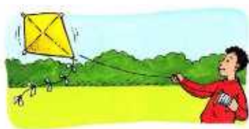
3. flew a kite