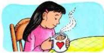
6. drank hot chocolate