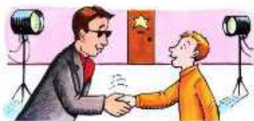
5. met a movie star