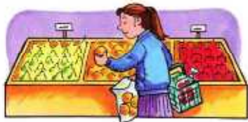
4. went to the store