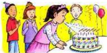
2. had a party