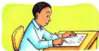
1. took a test