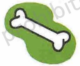
b _ n _