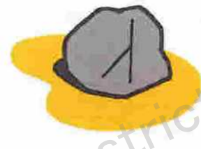
st _ n _