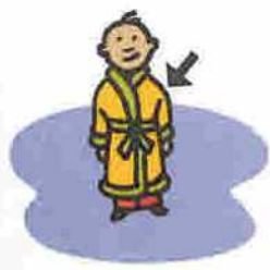
r _ b _