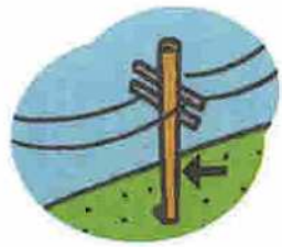
p _ l _