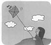
fly a kite