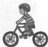
ride a bicycle