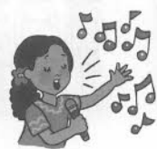
sing a song