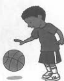
bounce a ball