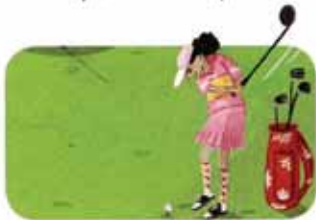
5. play golf