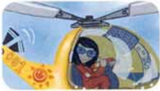
1. fly a helicopter