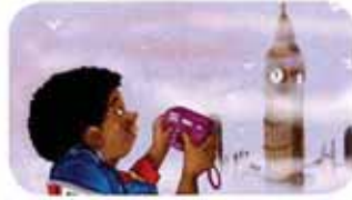
3. visit London