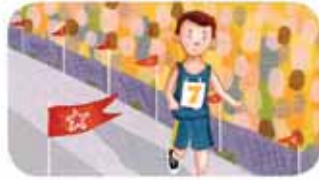
2. run a marathon