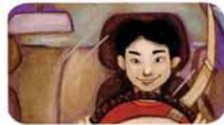
6. drive a car