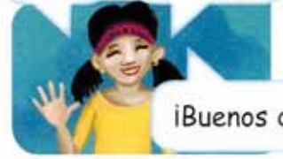
4. speak more languages