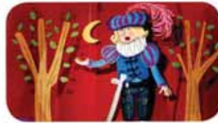
7. act in a play