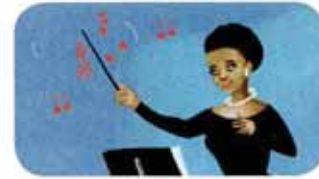
8. conduct an orchestra