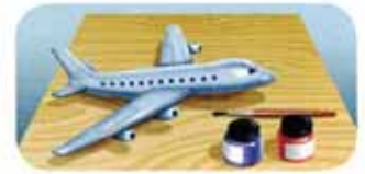
8. a model