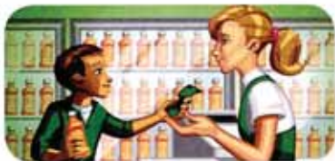
1. bought a drink