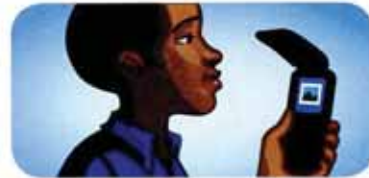
3. sent a picture