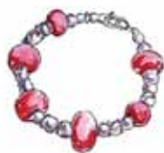
2. a bracelet