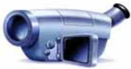
1. a video camera