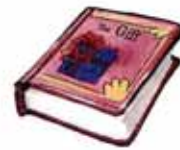
6. a book