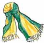
1. a scarf