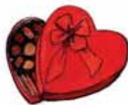
3. a box of chocolates