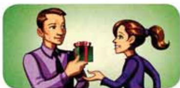
4. gave a present