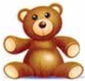
5. a stuffed toy