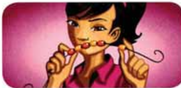
2. made a bracelet