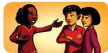
6. told a story