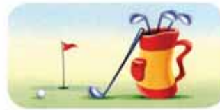
7. golf clubs