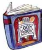
4. a cookbook