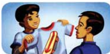
5. showed a T-shirt