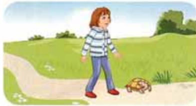
2. walk slowly