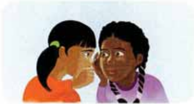
4. speak quietly