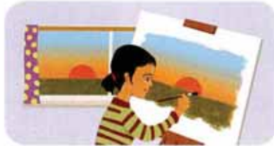
5. paint beautifully