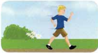
1. walk quickly