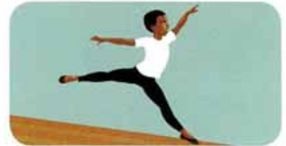
6. dance gracefully