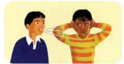
3. speak loudly