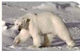
6. a polar bear 43 kph