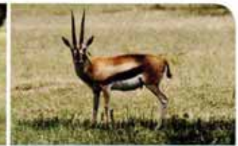
4. a gazelle 80 kph