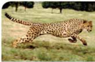
3. a cheetah 114 kph