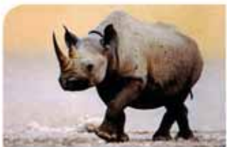
5. a rhinoceros 43 kph