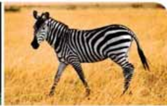
2. a zebra 64 kph