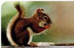
7. a squirrel 19 kph