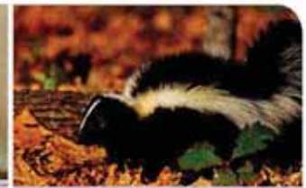
8. a skunk 12 kph