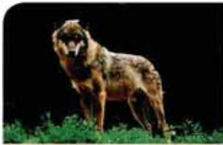
1. a wolf 64 kph