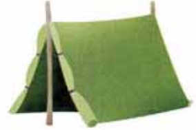
4. a tent