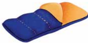
6. a sleeping bag