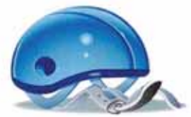
4. a helmet