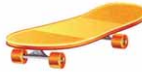
3. a skateboard