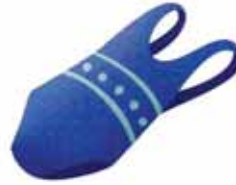
3. a swimsuit