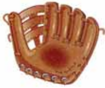
1. a mitt