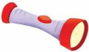
5. a flashlight