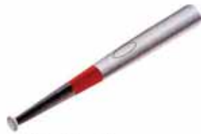
2. a bat