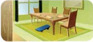
4. dining room