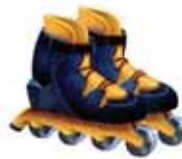
7. in-line skates