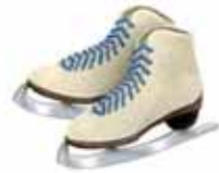
8. ice skates