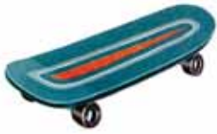
1. a skateboard