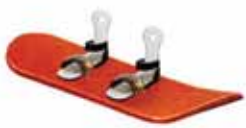
5. a snowboard