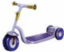
2. a scooter