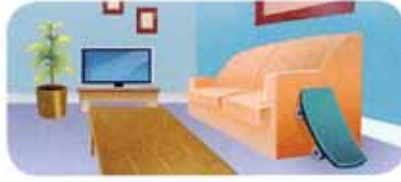
2. living room