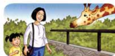
6. at the zoo