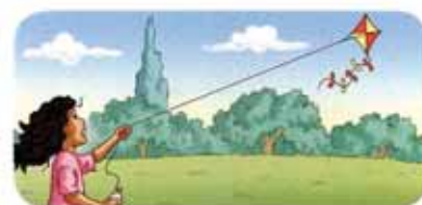
3. at the park