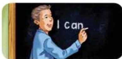
2. at school