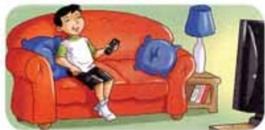
1. at home