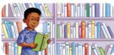
5. at the library