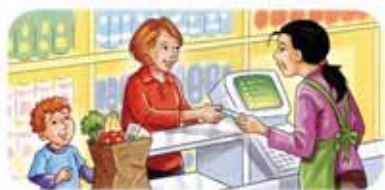
4. at the store