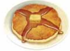
4. a pancake