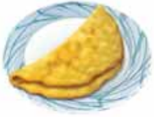
1. an omelet