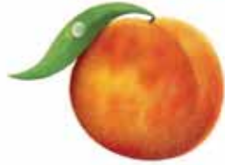
2. a peach