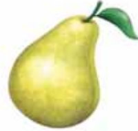
3. a pear