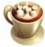
8. hot chocolate