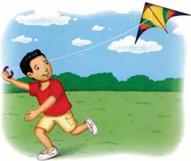
3. fly a kite