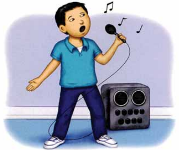
2. sing a song