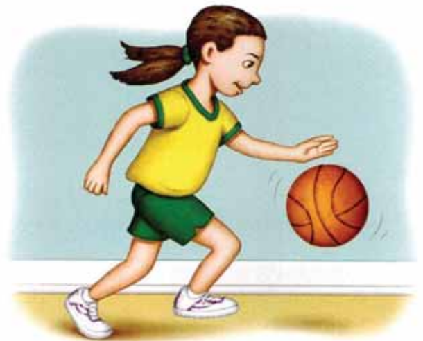
4. bounce a ball