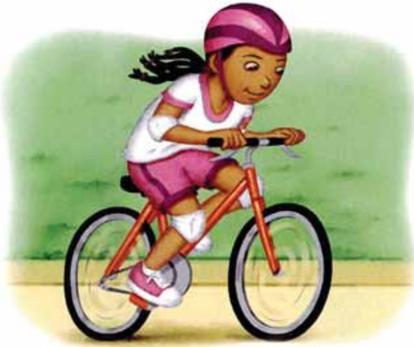
1. ride a bicycle