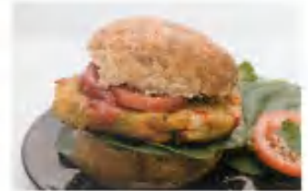
a veggie burger