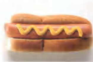
a hot dog