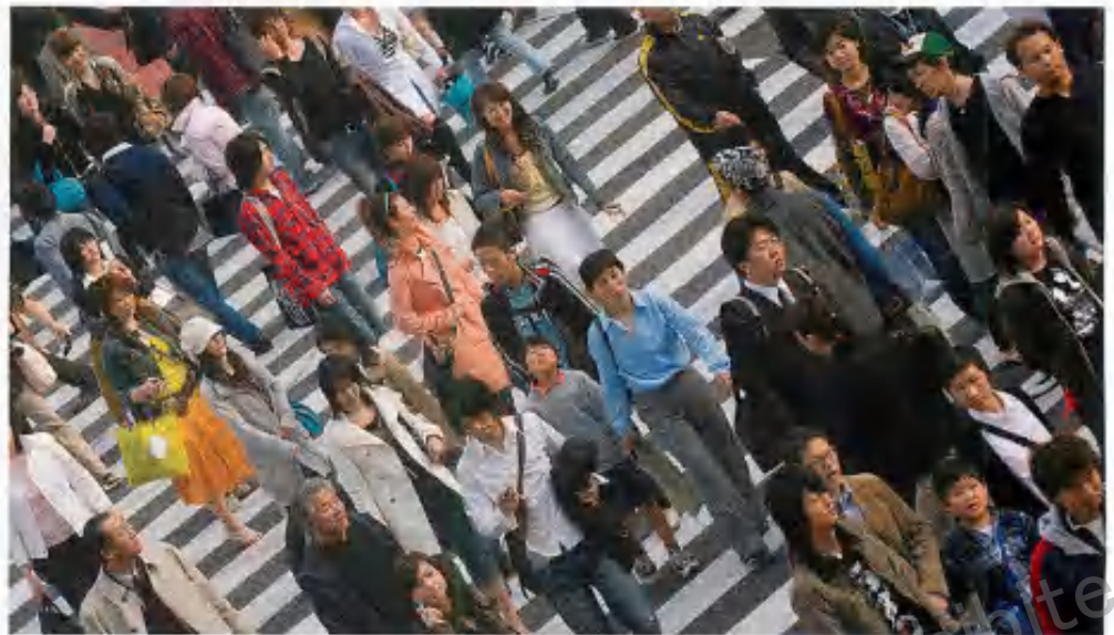
How many times have you changed jobs?