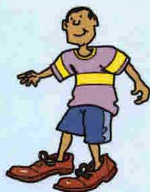
The shoes are too big for him.