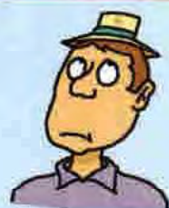
not big enough