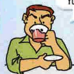
There is too much sugar in it.