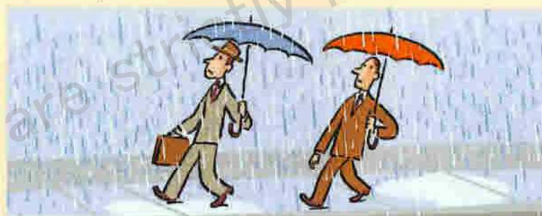
It's raining heavily .