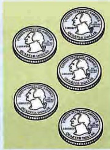
not much money