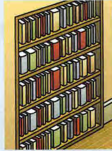
a lot of books