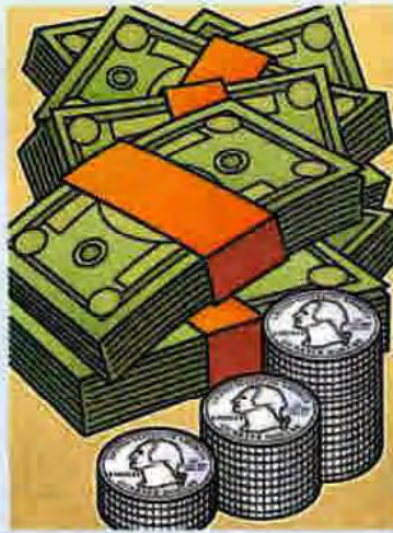
a lot of money