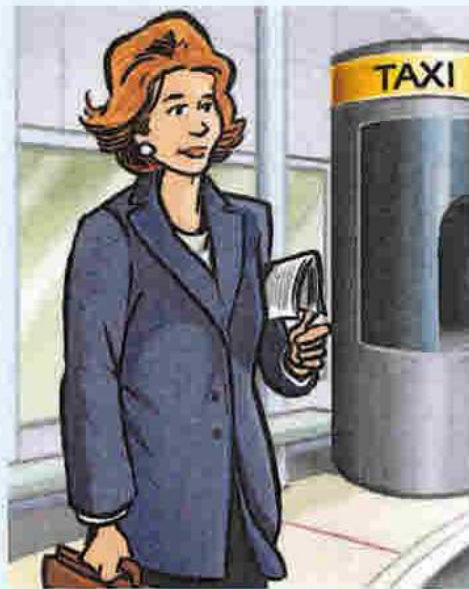
She's waiting for a taxi.