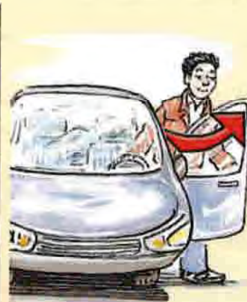
get out (of a car)