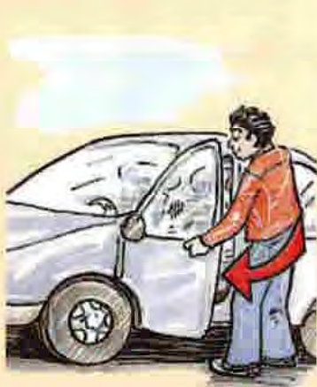
get in (a car)