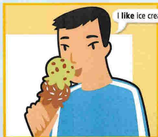
He's eating an ice cream cone. He likes ice cream.

They read / he likes / I work , etc. = the simple present :