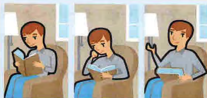
Day 1 Day 2 Day 3