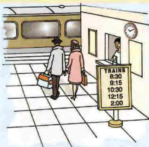
There's a train at 10:30.