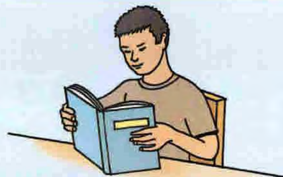
I like this book . It's interesting. (it = this book)