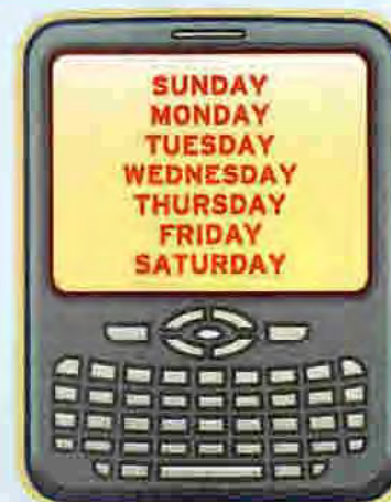
There are seven days in a week.