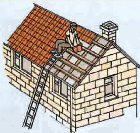
There's a man on the roof.