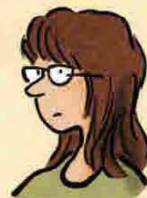
a woman with glasses