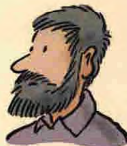
a man with a beard