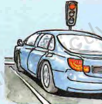
at the traffic light