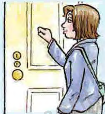
at the door