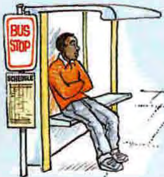
at the bus stop