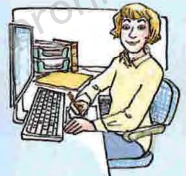
at her desk