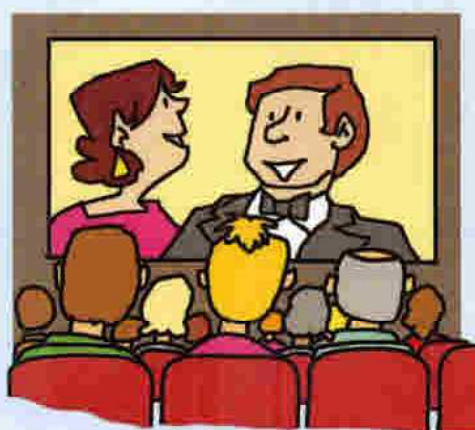
during the movie