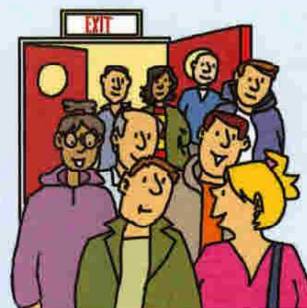
after the movie