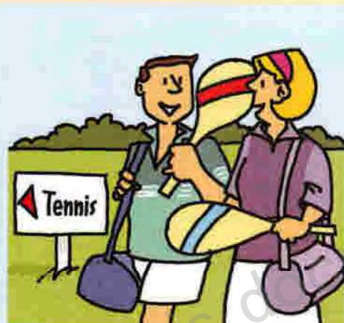
before we played