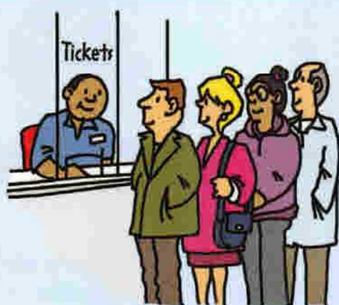
before the movie