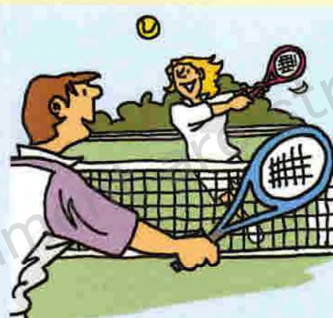
while we were playing