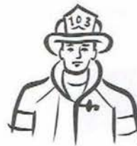
a fire fighter