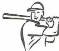
a professional athlete