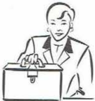
a business person