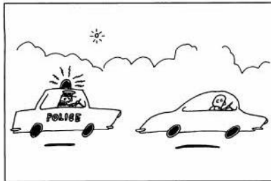
They drove down the motorway fast.