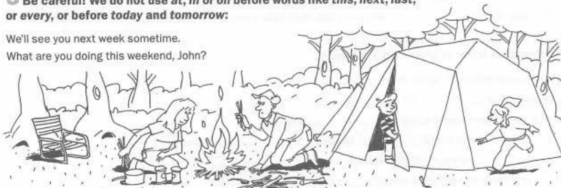
We go camping almost every summer.