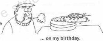
... on my birthday.