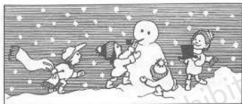
It often snows in winter.